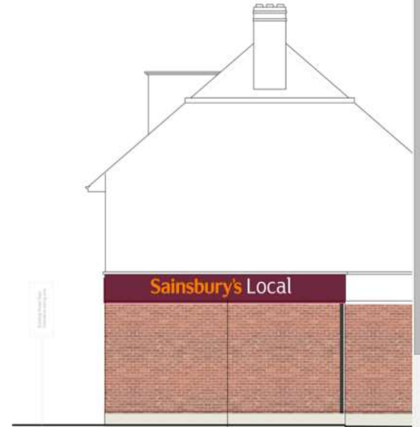
01 PROPOSED FRONT ELEVATION - UPPER HAM ROAD

New Sainsbury's Local sign 375mm high letters fret out of aluminum back panel fascia with push through acrylic letters, back illuminated. Fascia decorated in Sainsbury's plum. All dims tbc on site.